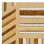
BT109002 Ocre jaune