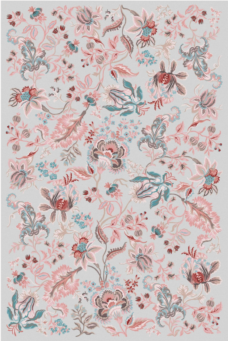
BT119001 - Corail

With its extensive floral Indian inspiration, this variant of Bangalore plays with texture through a mixture of cut and looped velvet. The subtle variations of the silk of its exotic flowers blend harmoniously with its background of delicate woolen dots.