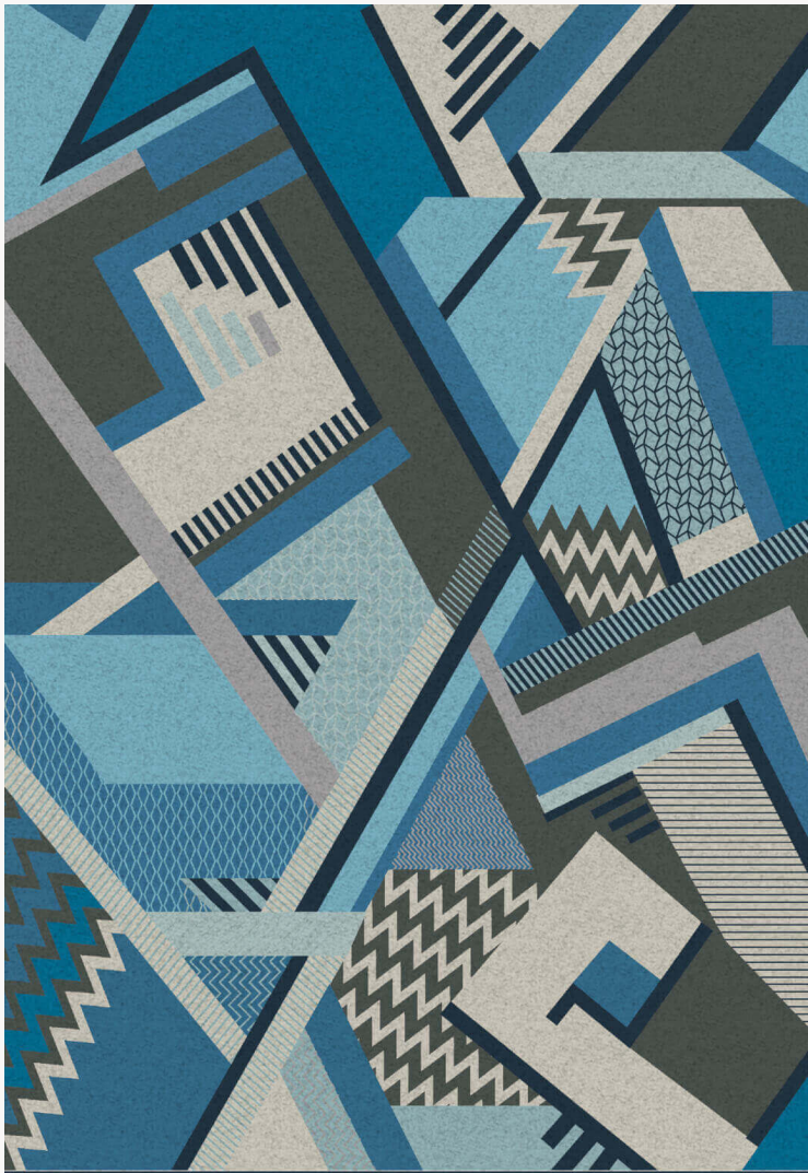
FT117003 - Gris

Hand-tufted rug in the spirit of Bauhaus, inspired by a geometric Art Deco sample (1923-1936) kept in the Maison Heritage Department. Cut pile, loop pile and tip shearing intermingle to compose this graphic pattern.