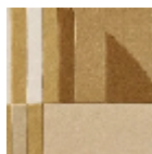
FT129003 TERRE DE SIENNE