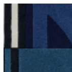
FT129001 Bleu canard