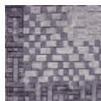
FT147001 Bleu pastel