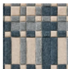
FT209003 Bleu gris