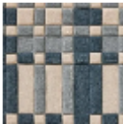
FT209003 Bleu gris