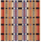
FT228001 MULTICOLOR E