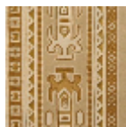
FT232002 Vieil or