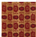
FT237003 Curry rouge