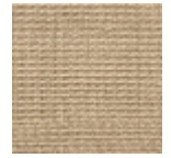
FT250007 Vieux rose