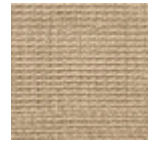
FT250007 Vieux rose