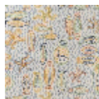
FT251001 MÉDITERRAN ÉE