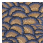
FT253001 Jaune d'or