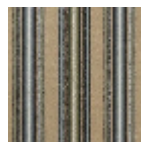
FT254003 Vert d'eau