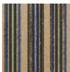
FT254001 Bleu marine