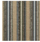
FT254003 Vert d'eau