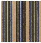
FT254001 Bleu marine