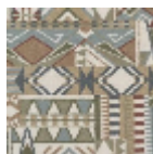
FT262002 Vert d'eau