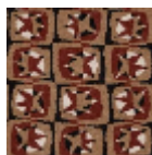
FT316003 TERRE CUITE