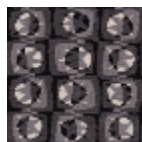
FT316001 NOIR ET BLANC