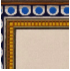
FT324001 RIVE DU NIL