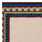
FT325001 RIVE DU NIL