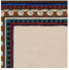
FT325001 RIVE DU NIL