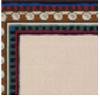
FT325001 RIVE DU NIL