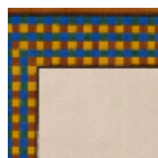
FT326001 RIVE DU NIL