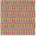
FT329001 RIVE DU NIL