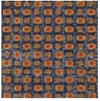
FT330001 RIVE DU NIL