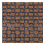
FT330001 RIVE DU NIL