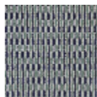
FT331001 RIVE DU NIL