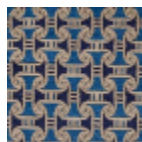
FT332001 RIVE DU NIL