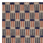
FT333001 RIVE DU NIL