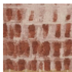
FT338002 TERRE D'EGYPTE