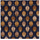
FT339001 BLEU DU NIL