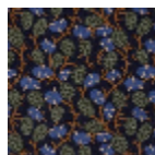
FT341001 BLEU DU NIL