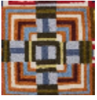
FT445001 MULTICOLOR E