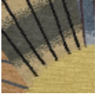
FT487001 MULTICOLOR E