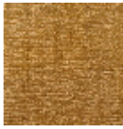
IT106003 Vieil or