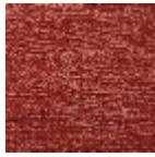
IT106002 Terre de sienne