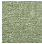
IT106005 Vert d'eau