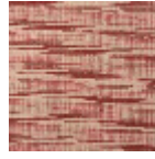
IT111005 Brique rose