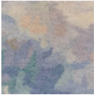
IT119001 ACQUA E CIELO