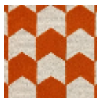
LTI06002 ORANGE/CRÈME ME