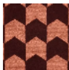
LTI06003 Brique rose