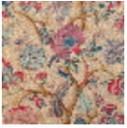
B080A001 Rouge fond crème