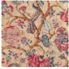
B080A003 Corail jaune