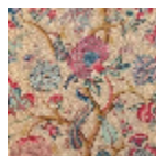
B080A001 Rouge fond crème