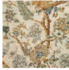
B080A004 Bleu or fond blanc