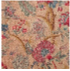
B080A002 Rouge fond bis