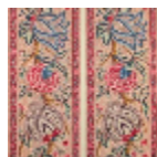
B080C001 Rouge fond crème