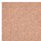
B081C002 Rouge fond bis