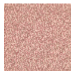
B081C001 Rouge fond crème