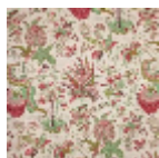
B1742002 Cretonne rouge vert