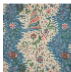
B1788006 Bleu fond crème