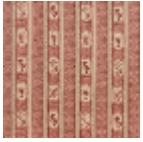
B1797000 Supportray maquisde pierr B1797001 Rouge