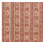
B1797000 Supportray maquisde pierr B1797001 Rouge