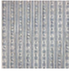
B1797001 Rouge B1797002 Bleu