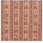
B1797000 Supportray maquisde pierr