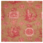
B1826001 Brun rouge