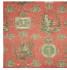
B1826004 Vert corail