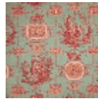
B1826005 Rouge celadon