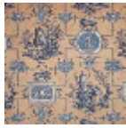
B1826002 Sable bleu