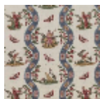
B1852001 Bleu rose