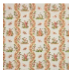
B1852003 Jaune corail