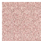
B1886001 Rose ancien