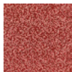
B1887001 Rose ancien