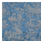
B7544006 Bleu faience