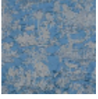
B7544006 Bleu faience