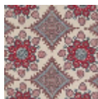
B7550003 Bleu ancien