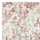
B7553001 Gris bleu