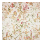
B7553003 Brun de toledo